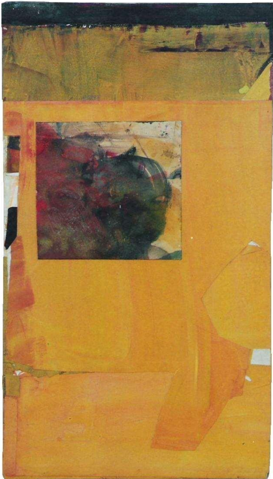
1994 Mirror 75cmx56cm acrylic on paper board ( Private Collection)