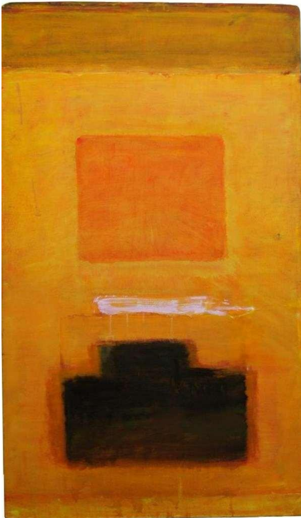
2003 yb 156cm×91cm Acrylic on canvas panel