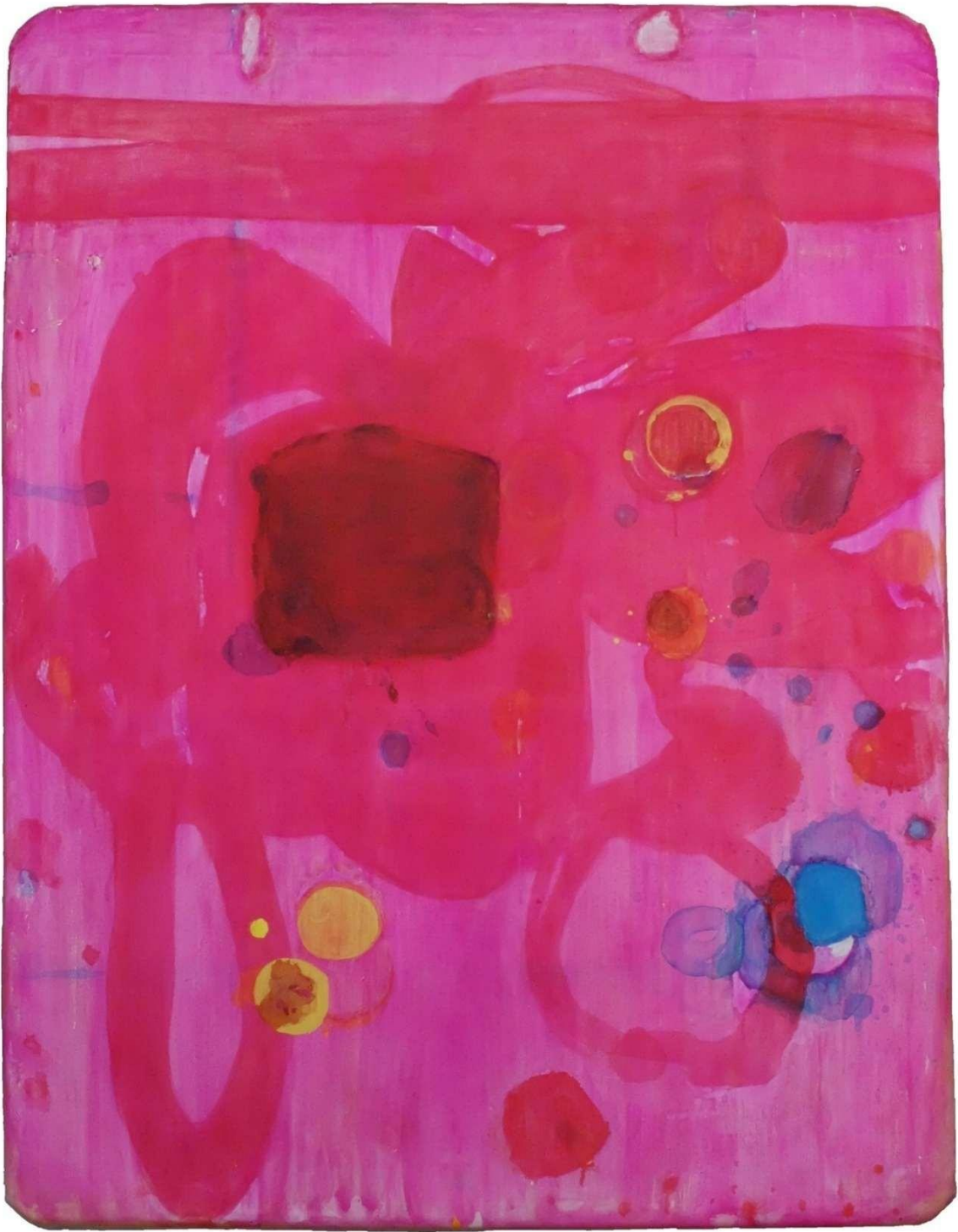
2018 Hanakana 165.5cmx125.5cm Acrylic on canvas