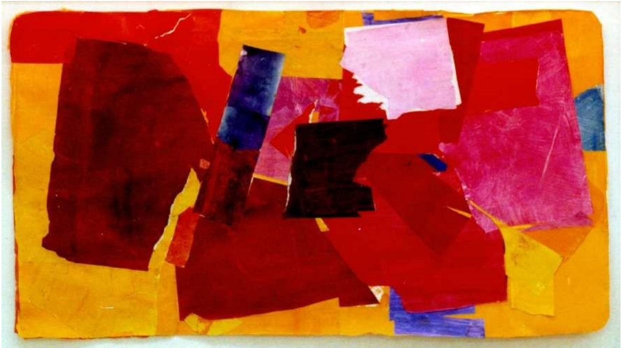
1987 Broken Book 75cm x 135.7cm Acrylic on paper, collage on paper