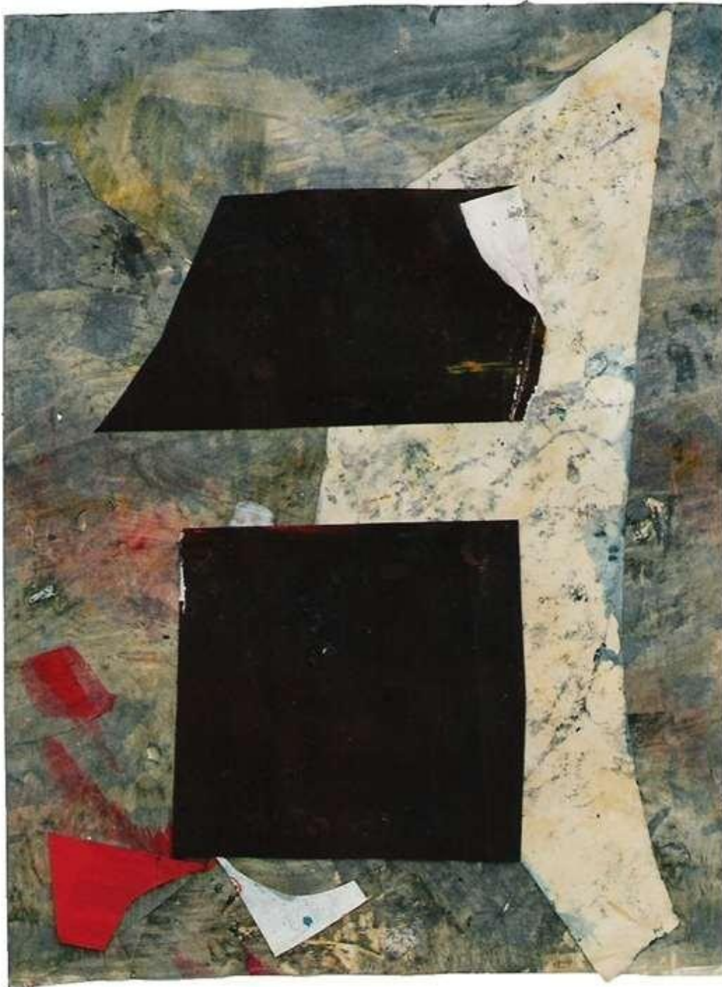
1992 Ishi no Ue (on the rock) 63cm×46cm Acrylic on paper, collage on paper