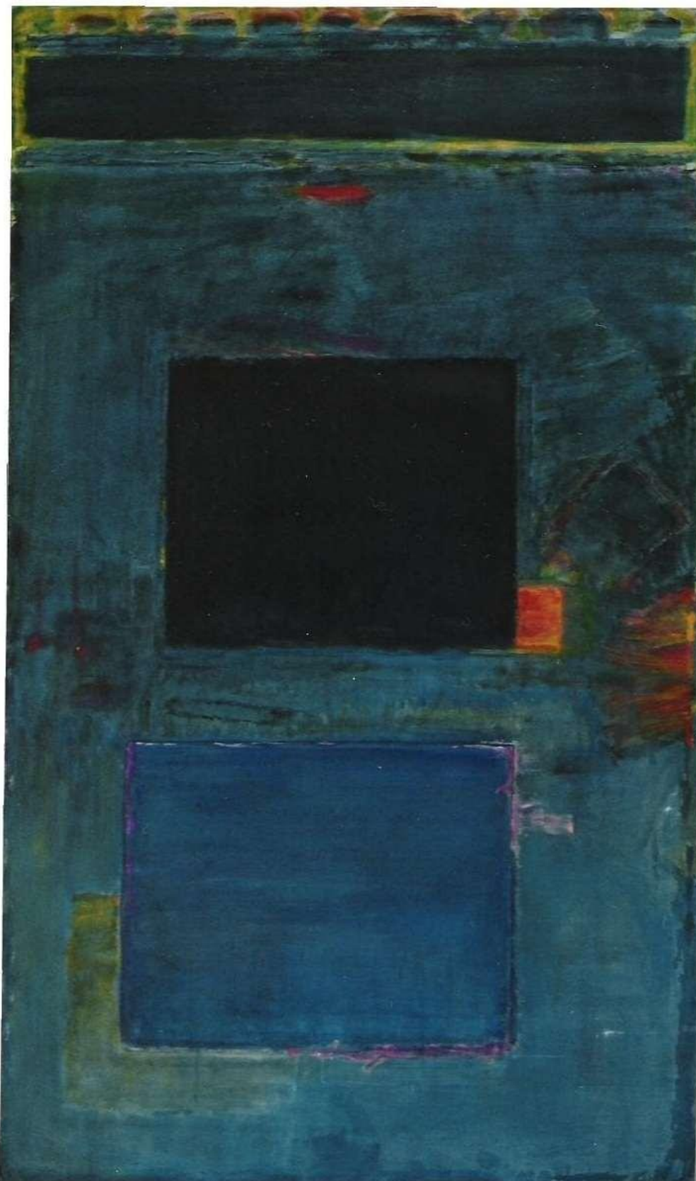
1996 Green and Blue 204cm×116cm Acrylic on canvas