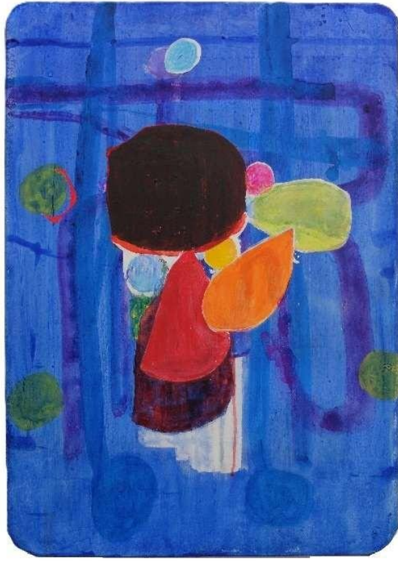
2024 Session No.4 73.5cmx51.7cm Acrylic on canvas