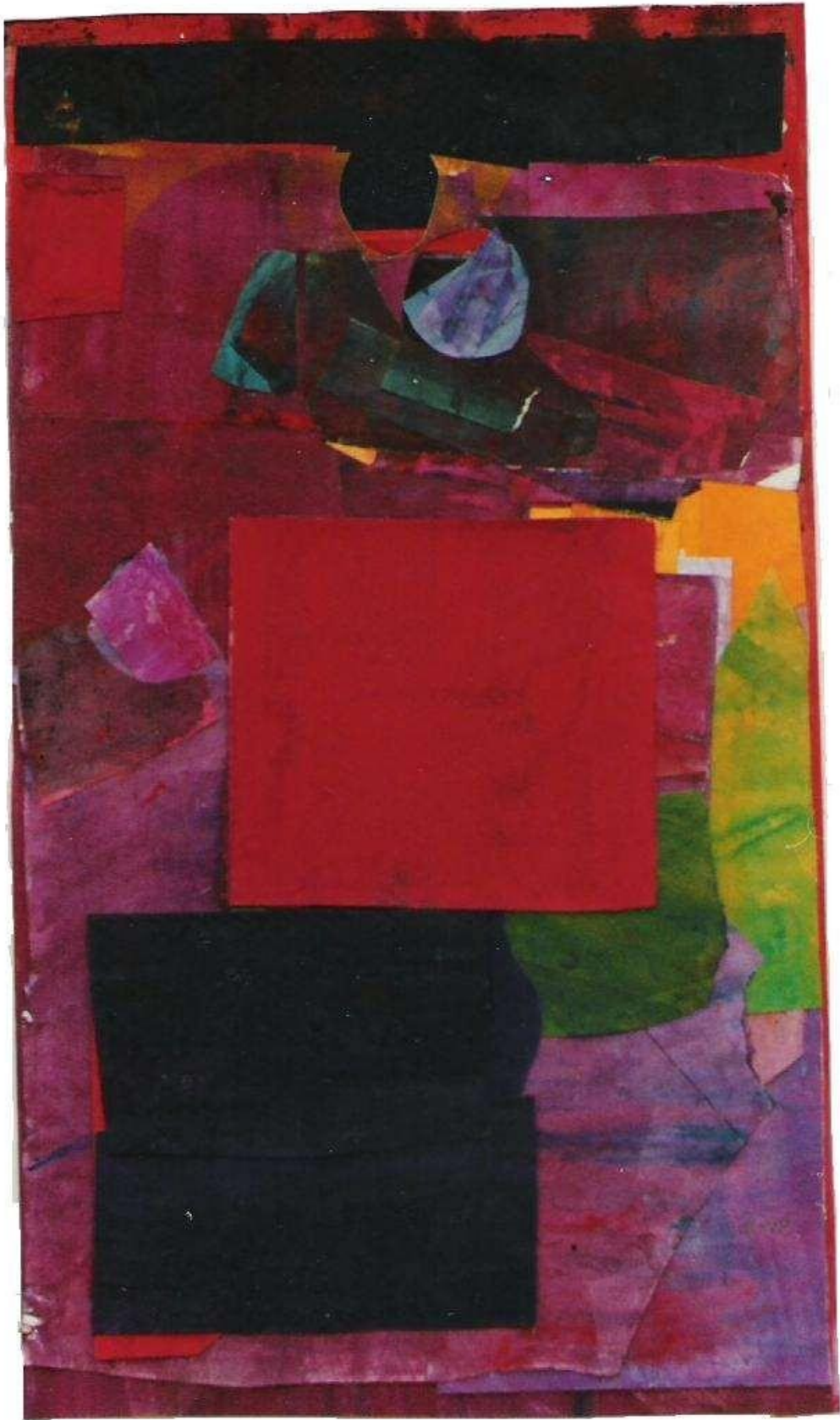
1991 Teien (Garden) 63cm×48cm Acrylic on paper, collage on paper