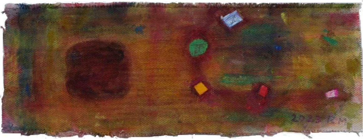
2023 Yume no Shikisaihen (Fragments of Dream Colors) 10cmx26.2cm Acrylic on canvas (Sold, Private Collection)